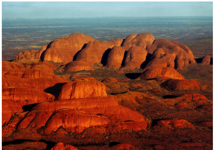
First in Landscape went to Shirley Schmidli with "Kata Tjuta" .