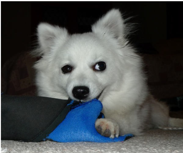
First in Household Pets went to Judith Walker with "P1160932.jpg"